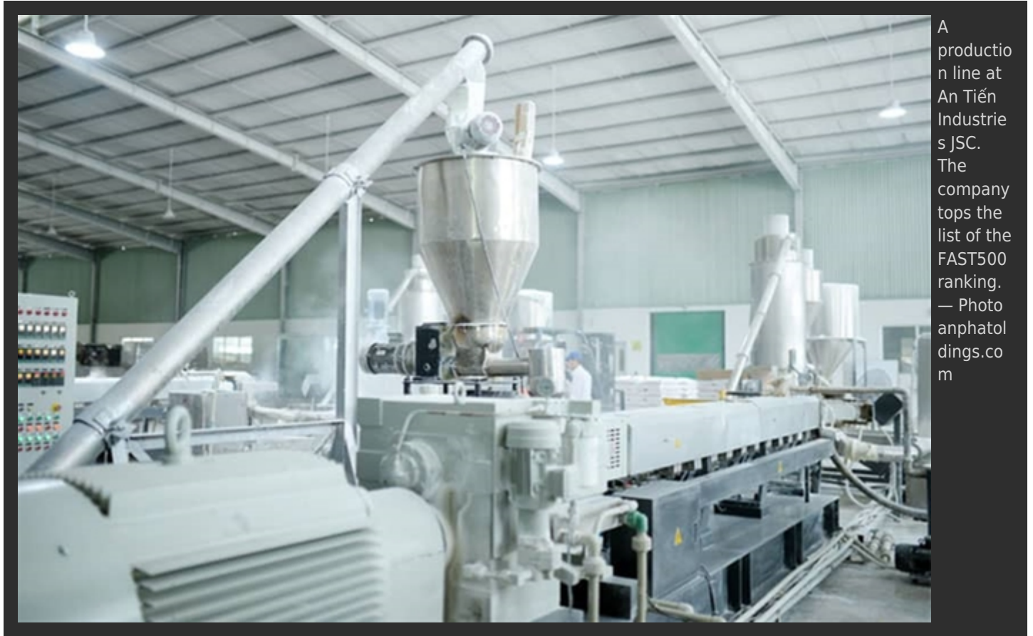
A production line at An Tiến Industries JSC. The company tops the list of the FAST500 ranking.

HÀ NỘI — Five sectors of telecoms, information and technology, clean agriculture, clean technologies, retail, healthcare and pharmaceuticals have potential for high growth in the next three years.